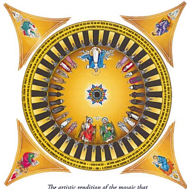
The artistic rendition of the mosaic that will adorn the Trinity Dome.

The Trinity Dome is the central and largest dome of the Basilica. This "Crowning Jewel" will be adorned in mosaic and will depict the Most Holy Trinity, the Blessed Virgin Mary as the Immaculate Conception, and a procession of saints who have an association with America and the Basilica. The Nicene Creed will encircle the base of the dome, while the dome's pendentives will feature the four evangelists: Matthew, Mark, Luke and John. The Trinity Dome will complete the work of the Great Upper Church according to its original iconographic scheme and bring to a close construction of the Basilica of the National Shrine of the Immaculate Conception as it approaches its centennial milestone in 2020.